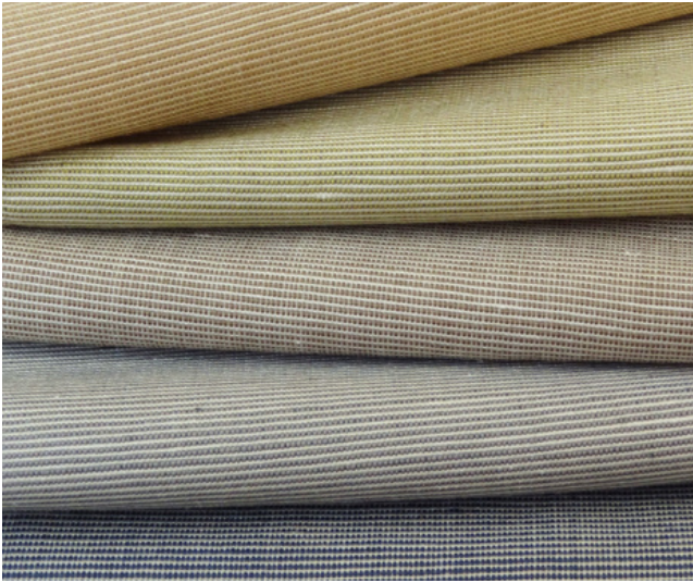
Straw | Moss | Canyon | Fog | North Sea