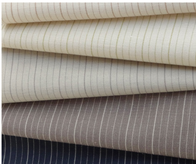
Straw | Moss | Fog | Canyon | North Sea