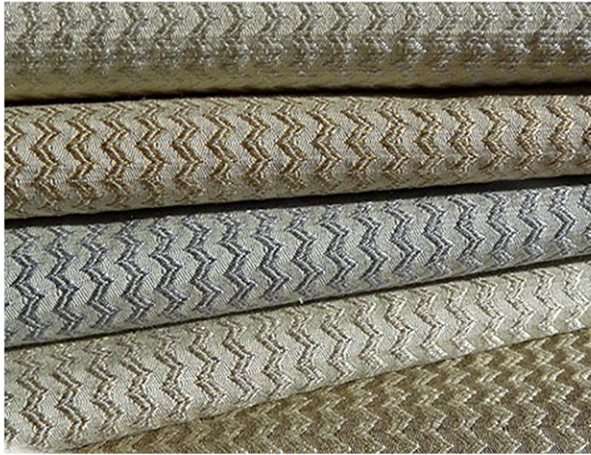
Dragon Dance Pearl | Gold | Silver | Pewter | Smoke