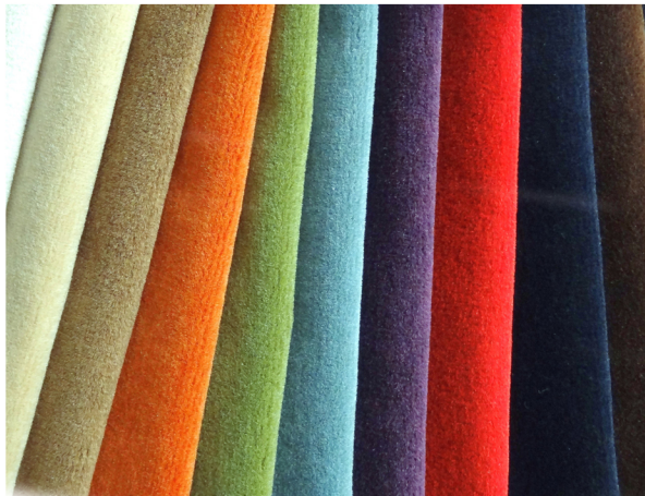
La Scala Oyster | Bluff | Hazelnut | Valencia | Hedge Dark Aegean | Night Sky | Violet | Tabriz | Sable Lava